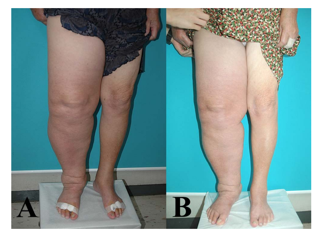
FIGURE 3 A, Pre-operative picture. B, Postoperative picture at 6 months postoperatively showed reasonable decrease of the overall limb volume. Moreover, no other episodes of infection or other complications were reported during the follow-up period

The appendix is a component of the gut-associated lymphoid tissue system and it is surrounded by lymphatic tissue and lymph nodes that play an important role in the host defense mechanism. (Corner, 1910) The appendix is an immunologic organ that actively participates